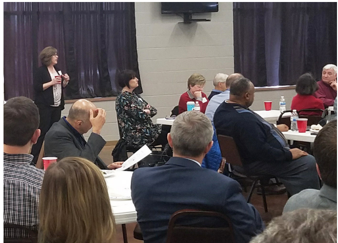
Community Outreach Event, Northside Association for Community Development

An annual report of the KCBRA Tax Increment Revenue collections from Brownfield Plans was submitted to the State in August 2017 as required by law.