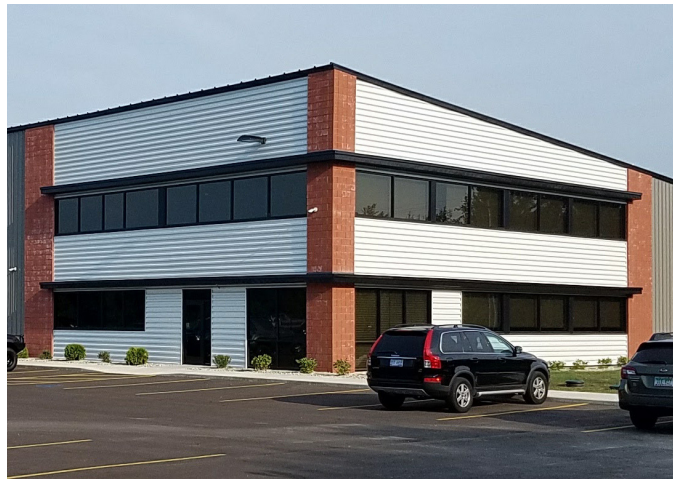
Metal Mechanics, Schoolcraft

Local Brownfield Revolving Funds as of the end of 2017.