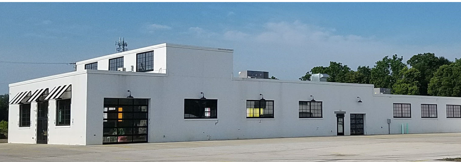
Clark Logic, 555 E. Eliza Street, Schoolcraft