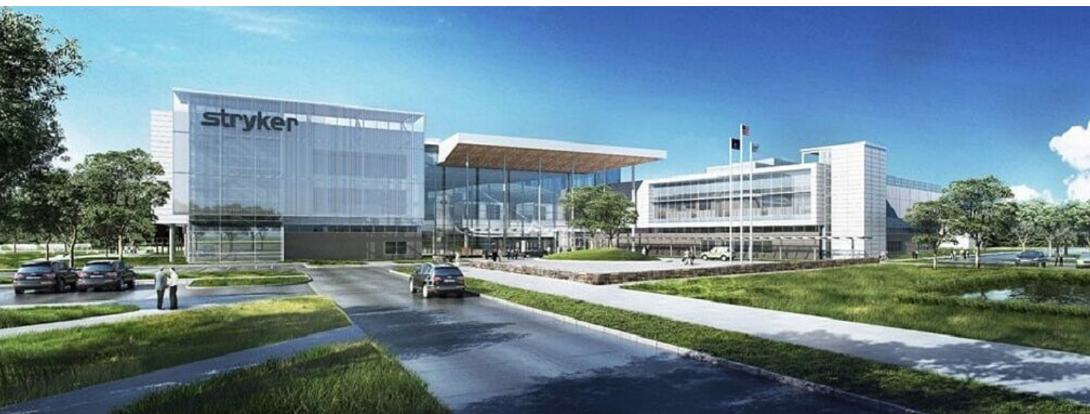
Stryker Instruments, Portage