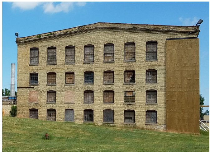
Vicksburg Paper Mill, Vicksburg

An annual report of the KCBRA Tax Increment Revenue collections from Brownfield Plans was submitted to the State in August 2018 as required by law.