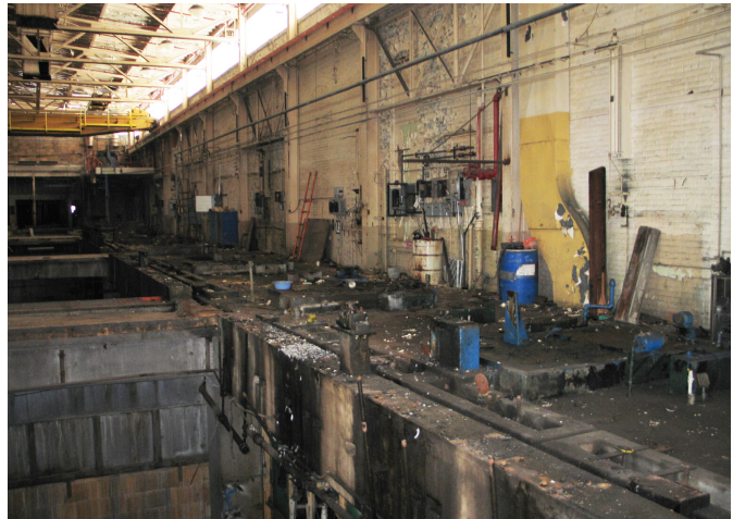
Vicksburg Paper Mill, Vicksburg

Local Brownfield Revolving Funds as of the end of 2018.